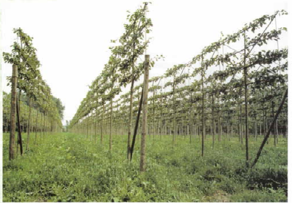
Tilia europaea 'Euchlora' (espaler).