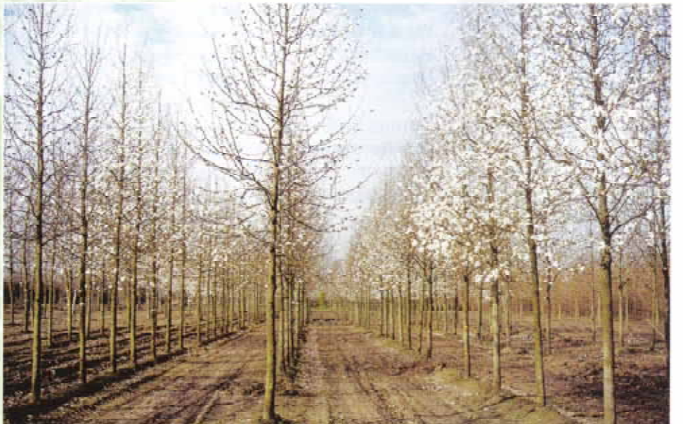
Magnolia kobus .